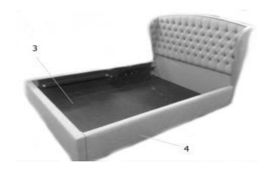
Step 4 Unpack the slatted frame work and lay on an even floor. Take the mattress stopper handle (the headboard end of the bed) and locate in the provided holes (pic A). Finally attach the strap to the bottom of the slatted frame. Opposite end to the handle (pic's B & C)