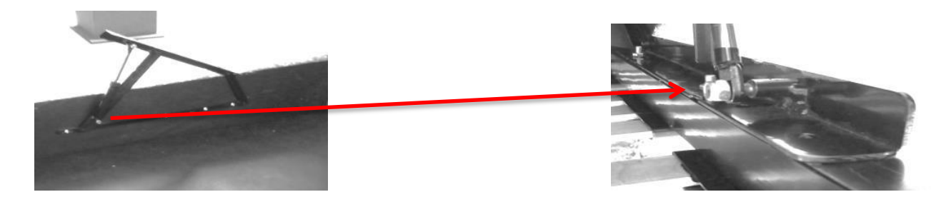
Secure and tighten all bolts before moving onto the next step

Raise the Metal arms on the bed, stretch out the gas pistons and using the bolts attached to the piston bolt them in to place on the metal arms.