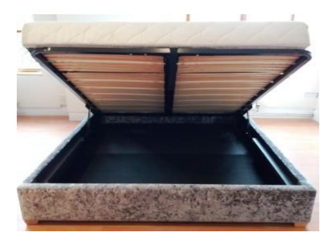
Enjoy your luxury Ottoman Bedstead!

Check that all bolts are tightened, lower the framework and introduce the mattress.